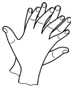
Step 2 Right palm over left dorsum and left palm over right dorsum (five times)