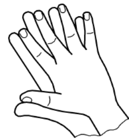
Step 3 Palm to palm with fingers interlaced (five times)