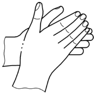
Step 1 Palm to palm

Pour appropriate volume of handrub product into the cupped dry hands and rub hands 30 s – 60 s in accordance with the standard handrub shown below to ensure total coverage of the hands. The action in each step is repeated five times before proceeding to the next step. After concluding step 6, recommence the series of steps as appropriate to complete the washing time.