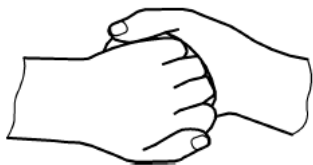
Step 4 Backs of fingers to opposing palms with fingers interlocked (five times)